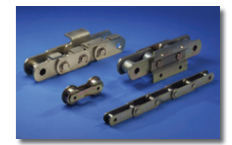
Plate link chains