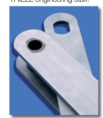
Patented T-Alpha cut-outs

THIELE engineers provide on-site consulting and analysis in conjunction with the customer for any particular conveying problem/s at hand, thus helping customers find an optimally engineered mobile chain system for the particular application. Subsequently, the customer/site-specific technical solution is developed in detail by THIELE engineering staff.